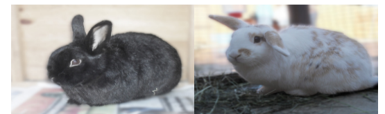
Milo & Fizz

In South Bedfordshire we sadly hear many horror stories and see first hand the effects of people's cruelty towards animals. Thankfully, we also meet a lot of very kind and thoughtful owners who help to restore our faith in the human race. Here are some 'good news' stories to bring a bit of festive cheer"