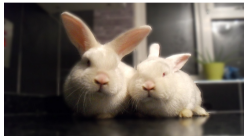
Snowy & Frosty

Still with us. Cherie's a beautiful friendly girl. She came to us when her owner could no longer look after her.