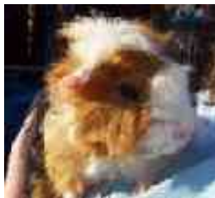
Squeak (currently in foster care waiting for a suitable home)