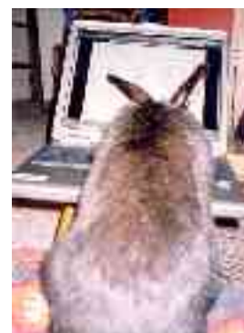
Spot at work

For more details of animals featured in this newsletter and other rabbits, cats and guinea-pigs looking for a new home please visit our web-site www.rspca-online.co.uk or tel 01582 472768.