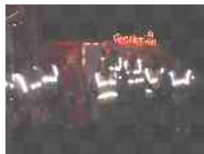
The Supporters with Santa.