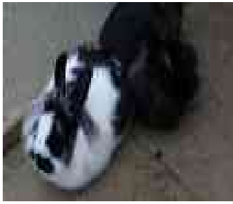
Domino & Jet (currently in foster care waiting for a suitable home)