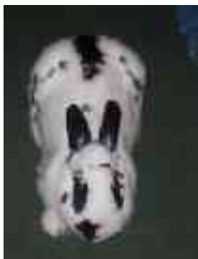
Speckles (currently in foster care waiting for a suitable home with a female)