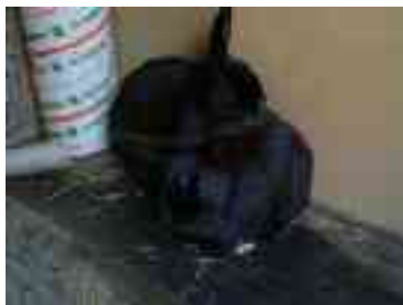
Blackberry and Apple (currently in foster care waiting for a suitable home)