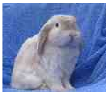
Phoenix (currently in foster care waiting for a suitable home)