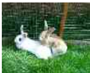
Abel and Cain (currently in foster care waiting for a suitable home)